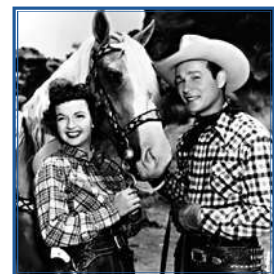
Roy Rogers, Trigger and Dale Evans