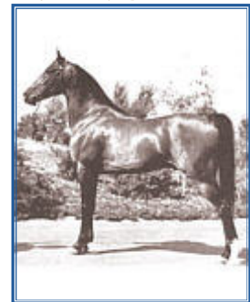
Farana, famous stock horse from Kelloggs, Pomona in the 1940's & 50's