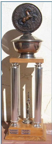
Memorial Award Trophy