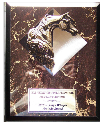
Keeper Plaque Awarded!